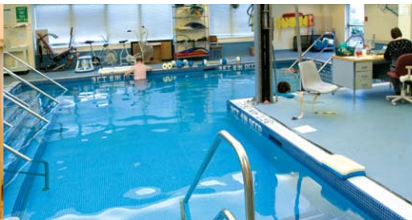
Therapeutic pool available for Rosa Coplon Rehab programs.