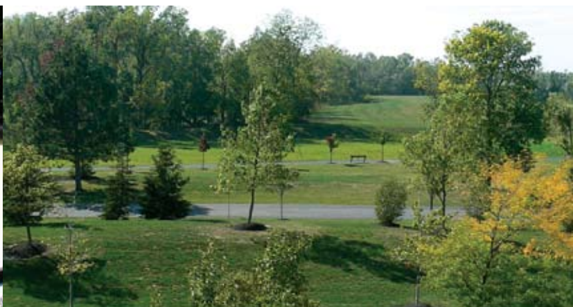
A view of the bike path from the window of a Rosa Coplon room.