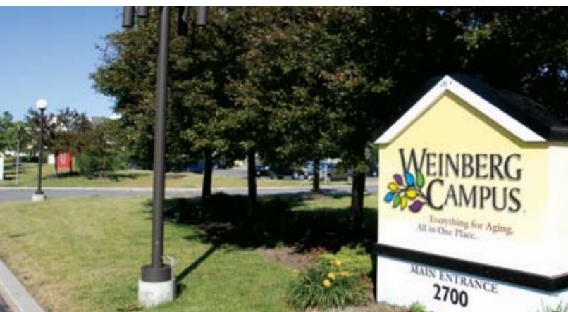
Weinberg Campus main entrance.