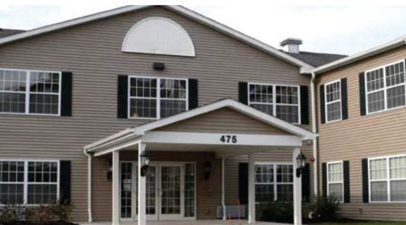
The main entrance to Amherst Towne Senior Apartments.