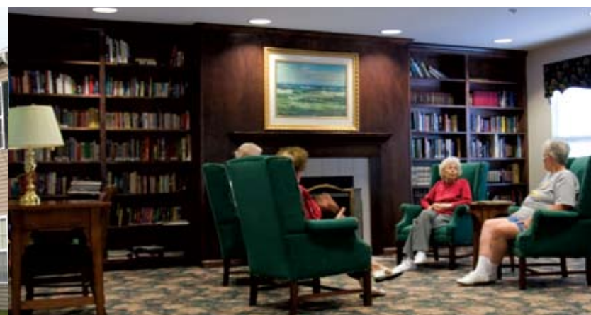
Residents enjoy the library with fireplace.